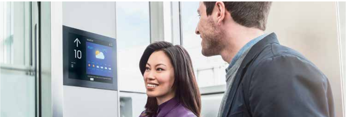
The KONE InfoScreen is an open channel of communication between you and elevator passengers.

* Online version is only available for KONE MonoSpace 700 and KONE MiniSpace.